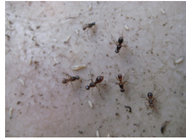
FIGURE 3. A group of scavenger fly, Allosepsis indica (Diptera: Sepsidae) aggregated on the pig's abdomen