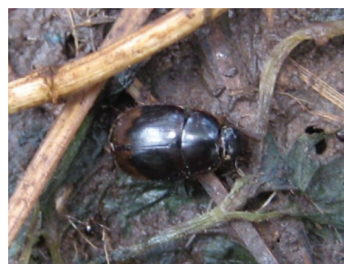
FIGURE 5. Water scavenger beetle, Sphaeridium sp. (Hydrophilidae) recovered at the bottom surface of pig carcass

within the plantation. These beetles are believed to be a common species in the plantation and used cow dung as their breeding ground and food source. Therefore, the presence of this beetle on pig carcass could be adventitious as their natural habitat is associated with cow dung in the oil palm plantation. However, their occurrence on the dead body may provide information pertaining to the locality of death and types of habitat of the crime scene.