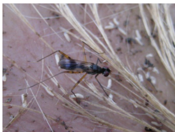
FIGURE 1. Stilt fly, Mimegralla albimana (Diptera: Micropezidae) landed on pig carcass

Scavenger flies of the genus Sepsis spp. are worldwide in distribution. These flies are attracted to carrion, excrement, and other types of decaying matter. They are sometimes mistaken for ants due to their smaller size and narrow “waist” (constricted abdomen). Scavenger flies can