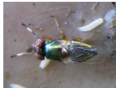
FIGURE 4. Physiphora sp. (Diptera: Ulidiidae) with white band on the fore leg

be abundant on carcasses, especially during the advanced stages of decay, as well as on excrement and other types of decaying matter (Greenberg 1971; James 1947; Smith 1975; Smith 1986). In our study, we found the same result where Allosepsis indica Wiedemann, 1824 (Diptera: Sepsidae) increased their population gradually from active decay stage (Day 4) to dry stage of decomposition (Day 9) (Table 1). This may be due to their preference for highly decomposed animal carcasses, which released stronger putrid smell. They were also observed to feed on decomposition fluid in a group.